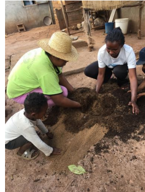
Prepping for a garden in a bag.