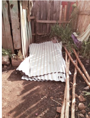
A new roof to stay dry under during rainy season.